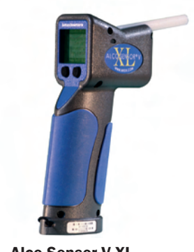
Alco-Sensor V XL (NOT APPROVED)

The Alco-Sensor devices implement the use of a fuel cell to measure alcohol in one's breath. The key to fuel cell testing is to utilize chemical compounds that create an electrical current only when exposed to ethyl alcohol. By measuring the current created, the device can determine the amount of alcohol in one's breath and thereby the bloodstream.