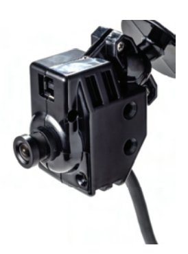
SMART START SSI-20/20 with Optional Camera