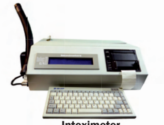
Intoximeter EC/IR II