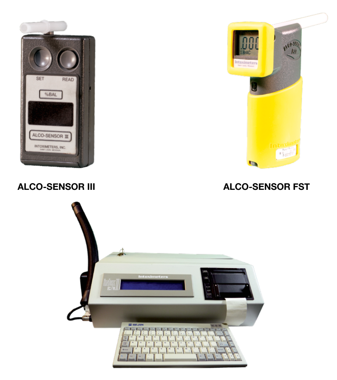
EC / IR II

The purpose of breath testing devices is to obtain a representative sample of ethanol expelled from the bloodstream and into the respiratory system through the lungs. Put simply, it seeks to capture what was most recently floating about in the bloodstream.